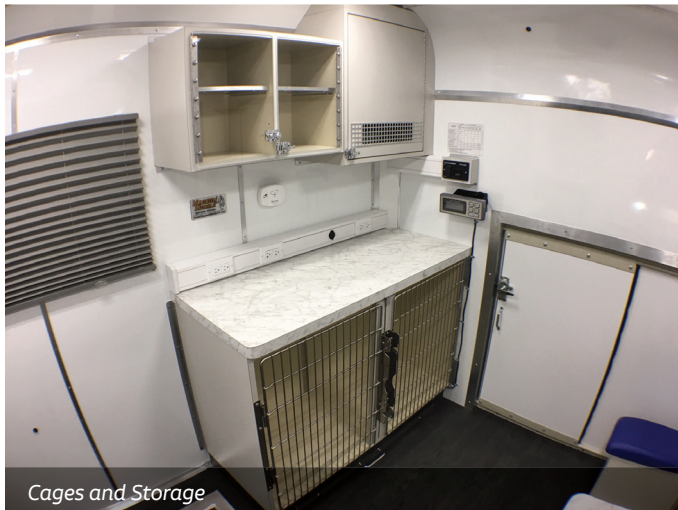
Cages and Storage