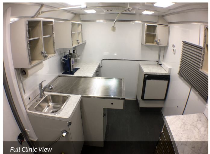
Full Clinic View