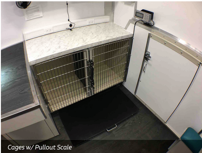
Cages w/ Pullout Scale