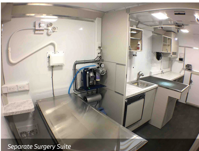
Separate Surgery Suite