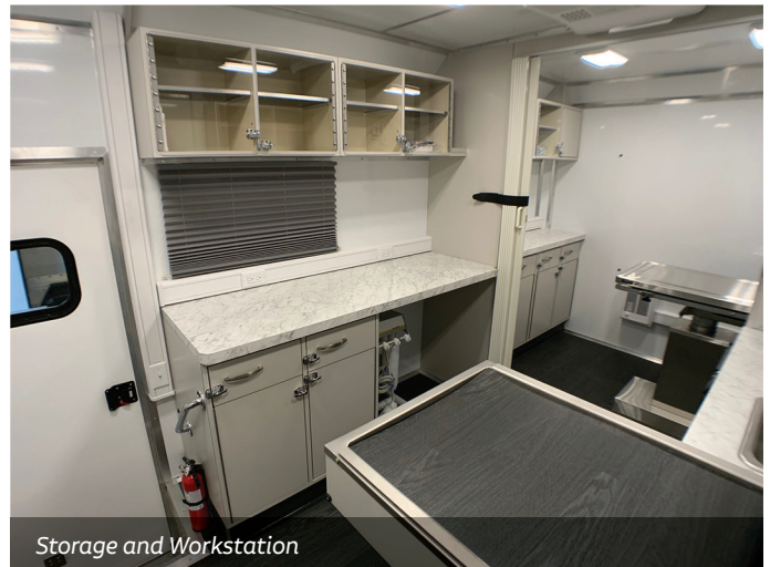
Storage and Workstation