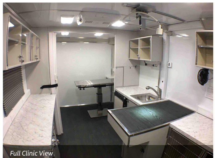
Full Clinic View