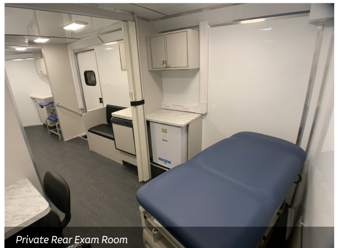
Private Rear Exam Room