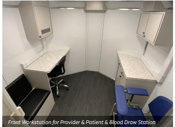
Front Workstation for Provider & Patient & Blood Draw Station