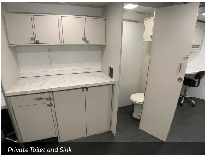
Private Toilet and Sink