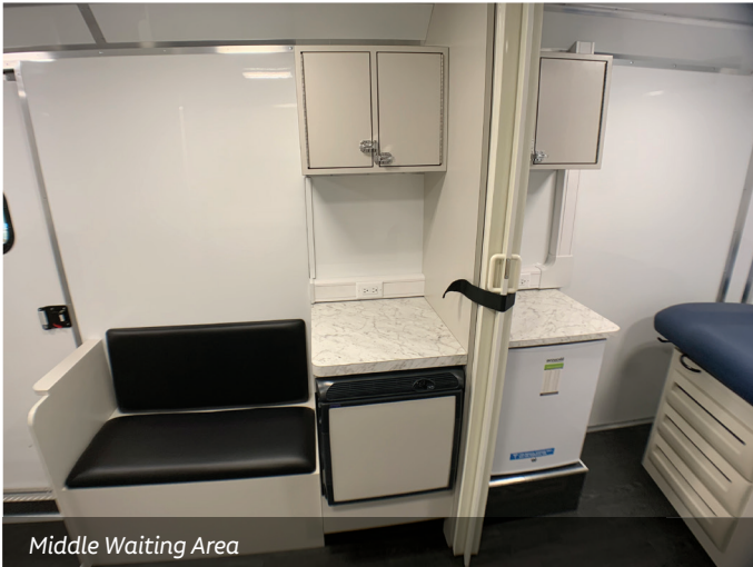
Middle Waiting Area