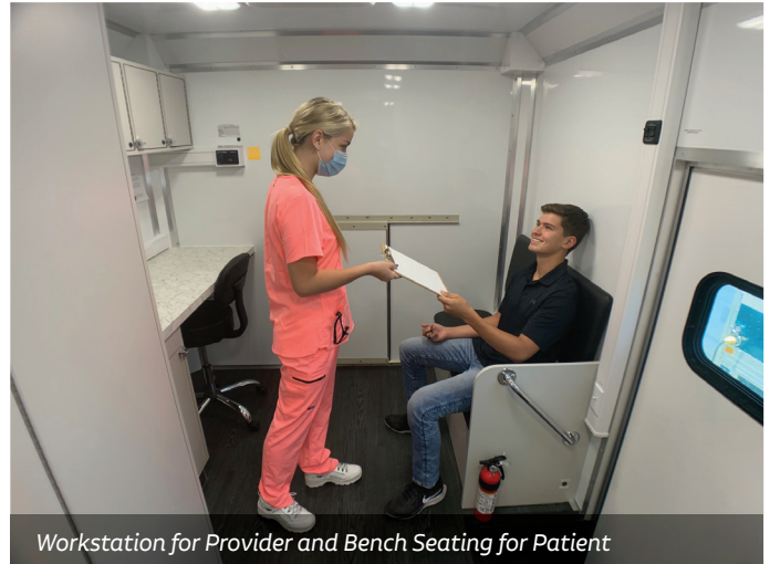
Workstation for Provider and Bench Seating for Patient