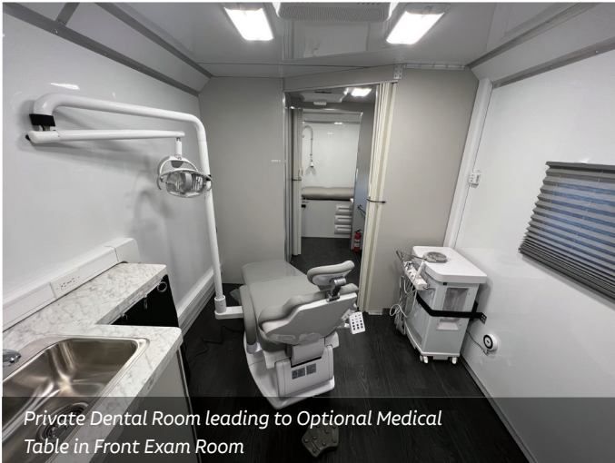
Private Dental Room leading to Optional Medical Table in Front Exam Room