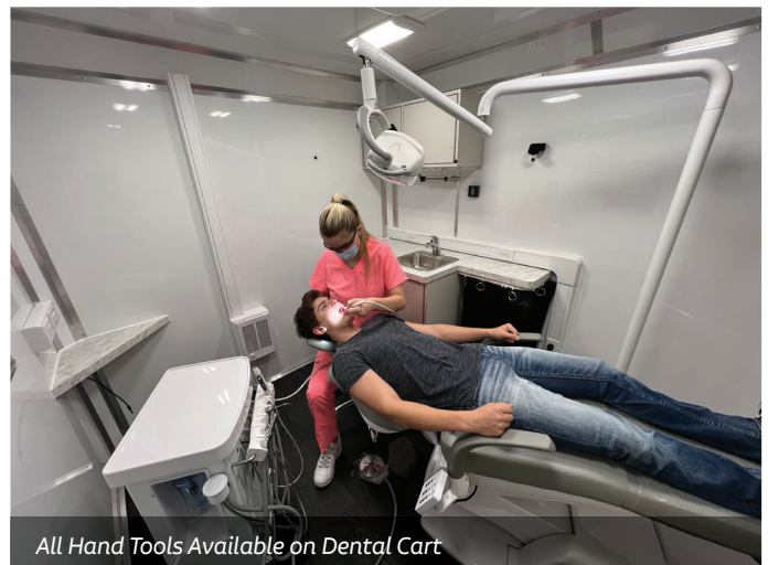
All Hand Tools Available on Dental Cart