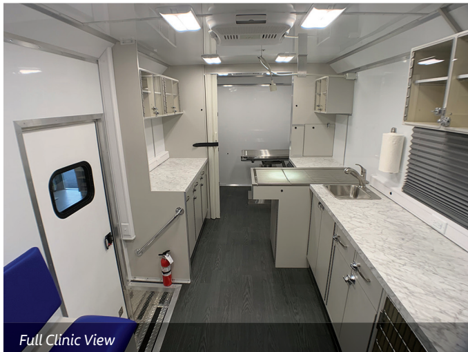
Full Clinic View