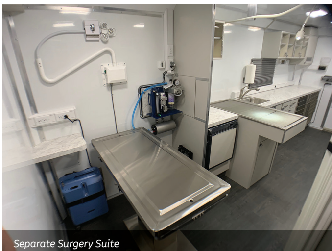
Separate Surgery Suite