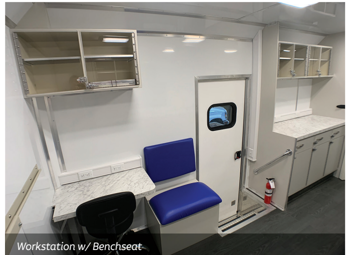
Workstation w/ Benchseat