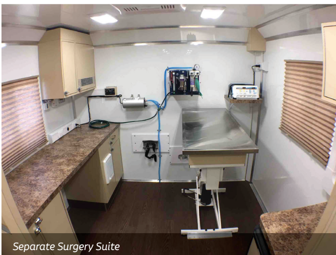
Separate Surgery Suite