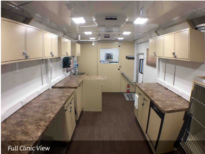
Full Clinic View