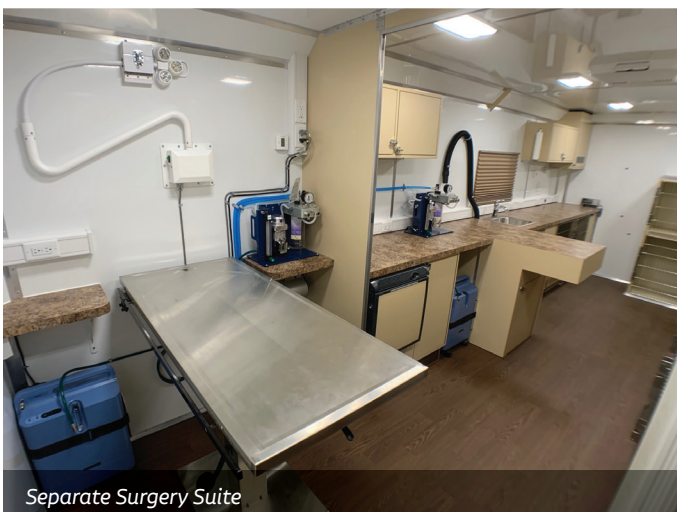
Separate Surgery Suite