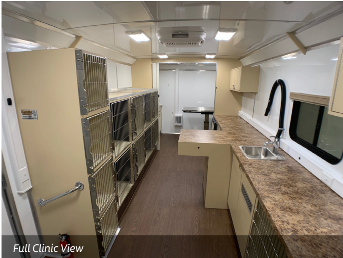
Full Clinic View