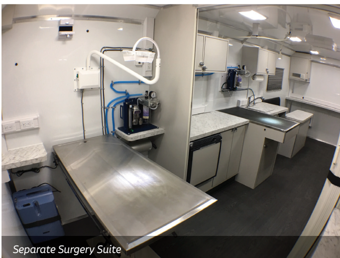
Separate Surgery Suite