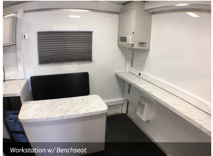
Workstation w/ Benchseat