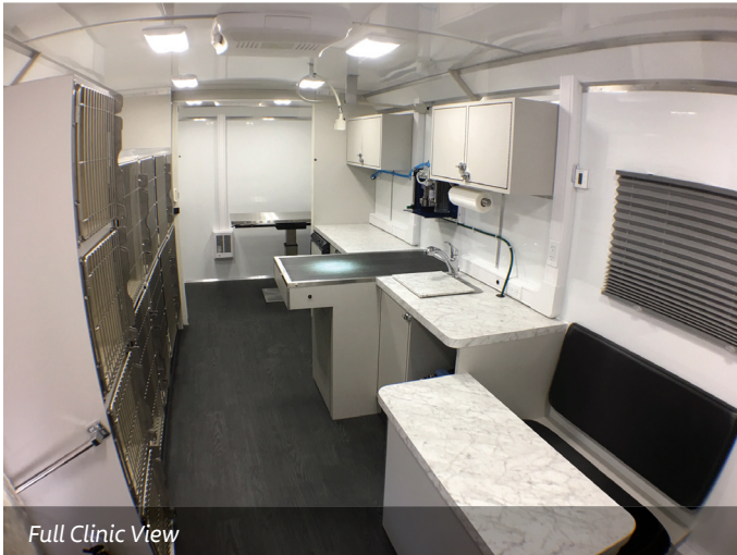
Full Clinic View